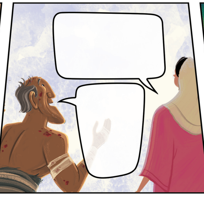
Job's wife spoke to Job. (Job 2:9) Job replied. (Job 2:10)

A servant spoke to Job. (Job 1:18-19) Job replied. (Job 1:20-21)